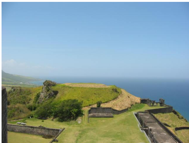
Incomparable view from the top of Ft. George

We anchored off Basseterre, St. Kitts at the very roly Deep Water Port, a stern anchor the only reason it was even moderately tolerable. On approach, we had seen massive Ft. George perched on the top of 800-foot Brimstone Hill and looked forward to exploring it firsthand. Taxis were lined up expectantly ashore awaiting to entertain off-season cruisers and an island tour was arranged as soon as we set foot on the pier.