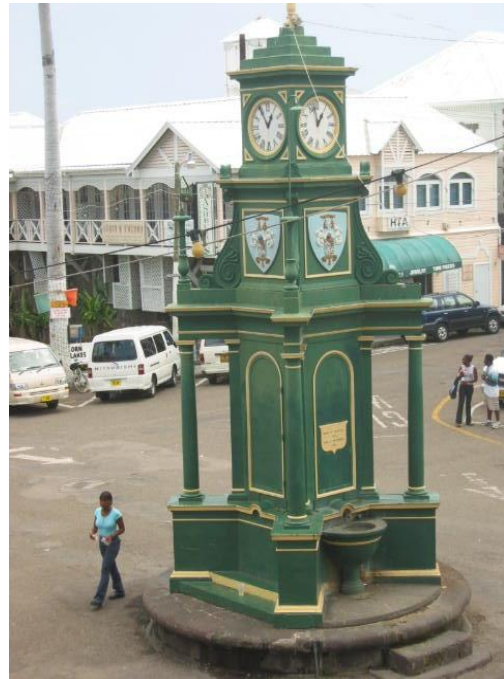
Huge green town clock in Piccadilly Circus-like downtown Basseterre.

Though only 65 square miles, St. Kitts has lots to offer the visiting cruiser in the way of sightseeing, though mariner facilities are limited. Its history well preserved, the Kittians are hospitable and delighted to share their unique island heritage.