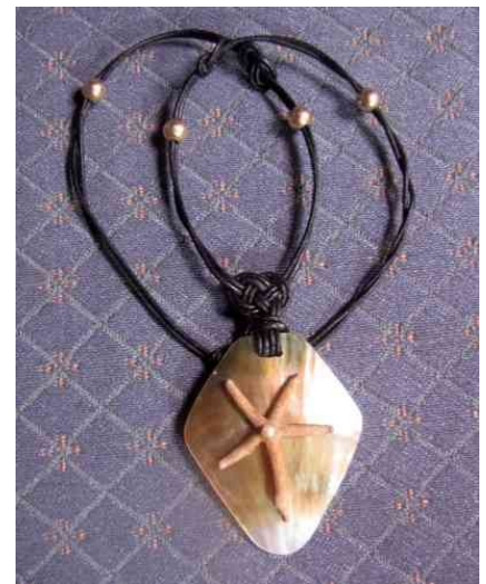
Mother of pearl pendant with a real starfish and tiny natural pearl from the Cook Islands.