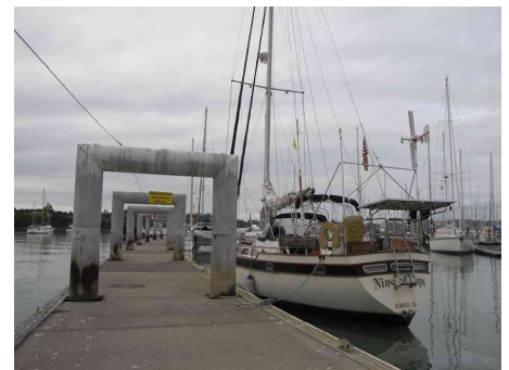
Cups at the Q Dock in Opuia

Well, it wasn't the easiest of passages. We started out with a permanently triple-reefed mainsail due to heavy repairs in Suvarrow. We had an engine oil leak en route. Then no wind, then too much wind and in the wrong direction, BUT we're here in Opuia, New Zealand...safe and sound and already making repairs so we can head down the New Zealand coast for the austral summer season. The passage was 1205nm and we sighed in relief as we arrived at the Quarantine dock in Opuia knowing that we'd completed over 9000 nm miles this season and it was time for a break.