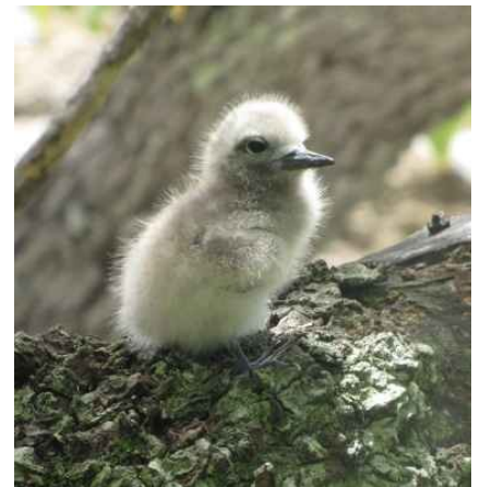
A fairy tern chick waits for Mom.