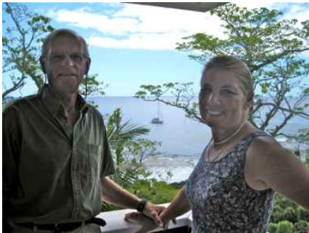
We enjoyed a royal welcome at Niue